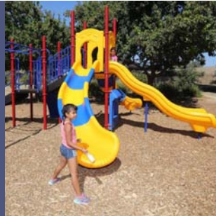
Stockton Shelter for the Homeless Playground: 134 Volunteer Days