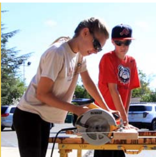
Middle School Program: 139 Youth & Adults