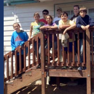
8 Sets of Stairs: Average Cost $300