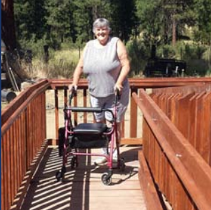
10 Wheelchair Ramps: Average Cost $1,000