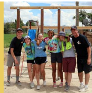
High School Program: 1,207 Youth & Adults