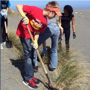
Tolowa Dunes Stewards: 248 Volunteer Days