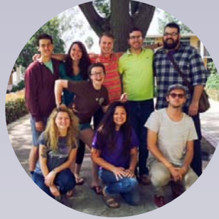
Leadership Academy: 9 Summer Staff