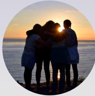
First Summer in San Diego: 354 Youth & Adults