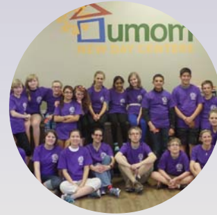
First Weekend of Service in Phoenix: 23 Youth & Adults

"The entire experience was a blessing. Especially meeting all those amazing kids."