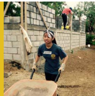
Nicaragua: 52 Intergenerational Team Members