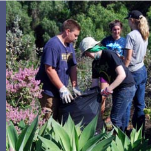
San Diego Canyonlands: 332 Volunteer Days