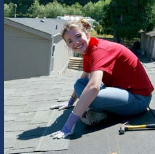
9 Roof Replacements: Average Cost $1,200