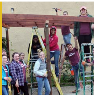
Alternative Breaks: 64 People from Youth & Young Adult Groups