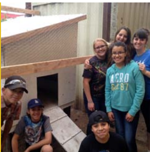
Weekends of Service: 324 Youth & Adults