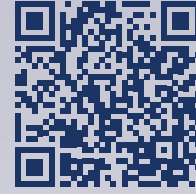
New Marketing Video & Website: Mobile Friendly