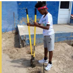
Combined Program: 421 Youth & Adults