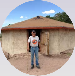
Halle Foundation: $78,000 Multi-Year Grant for Programs in Arizona. Largest in SSP's history!